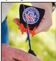
Serrated knife sharpening

Step 2 – Oil honing your blade to the final edge. Repeat as in step 1, but this time run a bead of oil on the edge of the blade. Lightly stroke the rods dead center for a polished shaving edge. However, if your knife has cheap steel you may not get a very sharp edge. Remember, the better the steel the better the edge.