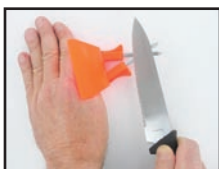
Dull Knife Preparation - A